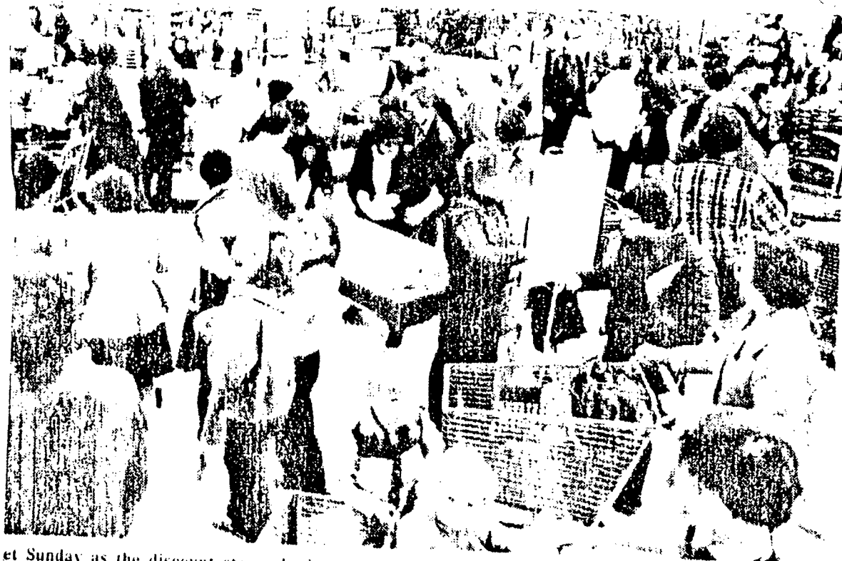
et Sunday as the discount store business. week after the store opened for